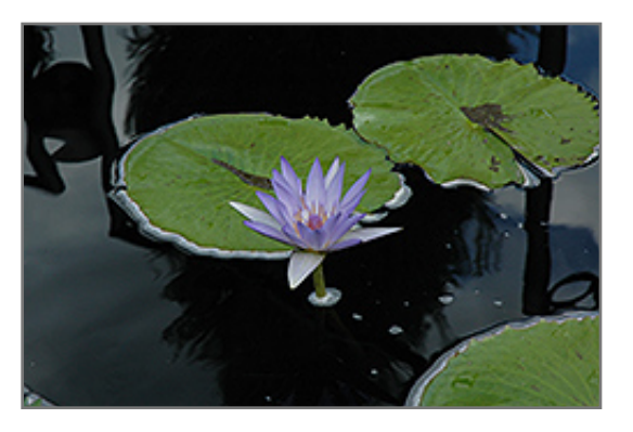
Blue Beauty Tropical Water Lily flowers

Blue Beauty Tropical Water Lily features showy fragrant semi-double blue cup-shaped flowers with yellow eyes at the ends of the stems from early summer to late fall. The flowers are excellent for cutting. Its attractive glossy round leaves emerge burgundy in spring, turning dark green in color with distinctive brown spots the rest of the year.