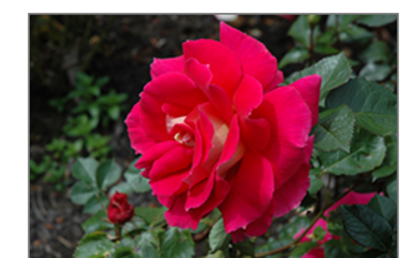
Miss Behavin' Rose flowers

361 N. Hunter Highway Drums, PA 18222 (570) 788-4181 www.beechwood-gardens.com