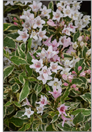
Mor-Colorful Weigela flowers

Mor-Colorful Weigela is recommended for the following landscape applications;