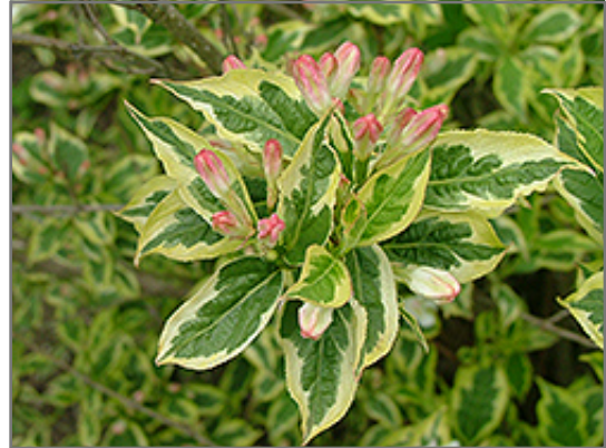
Mor-Colorful Weigela flowers

This shrub should only be grown in full sunlight. It prefers to grow in average to moist conditions, and shouldn't be allowed to dry out. It is not particular as to soil type or pH. It is highly tolerant of urban pollution and will even thrive in inner city environments. This is a selected variety of a species not originally from North America.