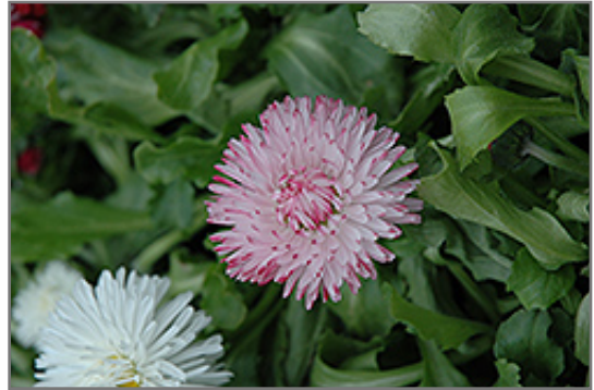
Enorma Pink English Daisy flowers