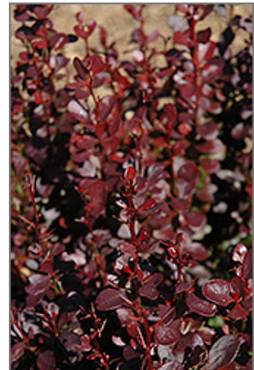
Rosy Rocket Barberry foliage