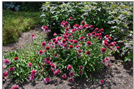
Double Scoop Bubble Gum Coneflower in bloom