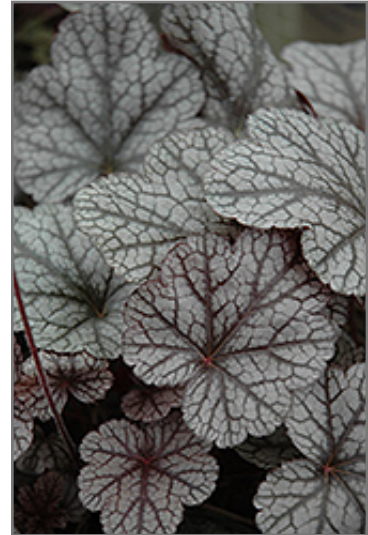
Prince Of Silver Coral Bells foliage