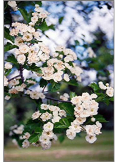
Snowbird Hawthorn flowers