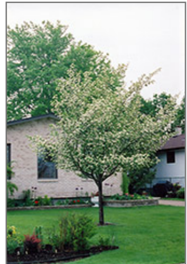
Snowbird Hawthorn in bloom