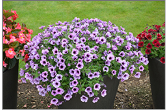
Supertunia Bordeaux Petunia in bloom

Supertunia Bordeaux Petunia is a fine choice for the garden, but it is also a good selection for planting in outdoor containers and hanging baskets. Because of its trailing habit of growth, it is ideally suited for use as a 'spiller' in the 'spiller-thriller-filler' container combination; plant it near the edges where it can spill gracefully over the pot. Note that when growing plants in outdoor containers and baskets, they may require more frequent waterings than they would in the yard or garden.