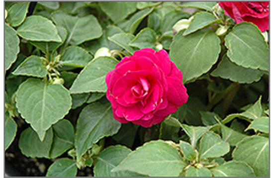
Fiesta Burgundy Double Impatiens flowers