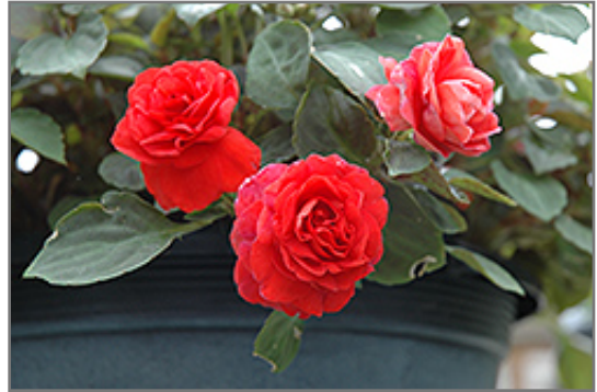
Fiesta Ole Deep Orange Double Impatiens flowers