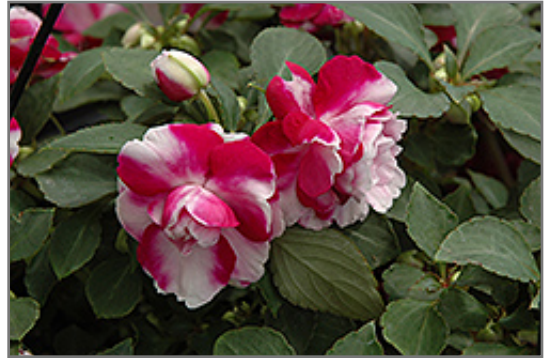
Fiesta Ole Purple Stripe Double Impatiens flowers