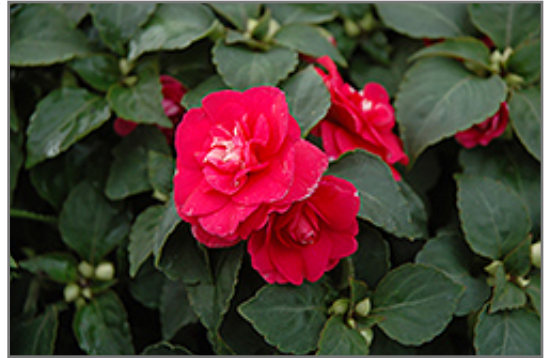
Fiesta Ole Rose Double Impatiens flowers