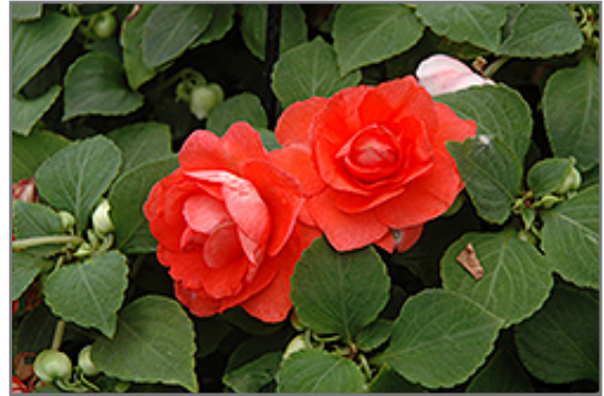
Fiesta Ole Salmon Double Impatiens flowers