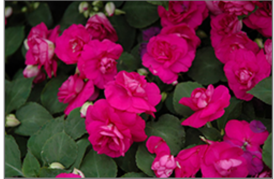
Fiesta Purple Double Impatiens flowers