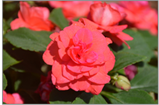
Rockapulco Coral Reef Impatiens flowers

Rockapulco Coral Reef Impatiens is recommended for the following landscape applications;