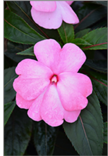
Super Sonic Pastel Pink New Guinea Impatiens flowers

Super Sonic Pastel Pink New Guinea Impatiens is recommended for the following landscape applications;