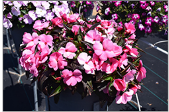
Sonic Light Pink New Guinea Impatiens in bloom

Sonic Light Pink New Guinea Impatiens will grow to be about 12 inches tall at maturity, with a spread of 12 inches. When grown in masses or used as a bedding plant, individual plants should be spaced approximately 10 inches apart. Its foliage tends to remain dense right to the ground, not requiring facer plants in front. This fast-growing annual will normally live for one full growing season, needing replacement the following year.