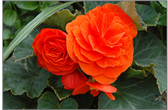
Nonstop Golden Orange Begonia flowers

A spectacular upright begonia presenting lovely dark, heart-shaped foliage; large, colorful double blooms are produced throughout the season; grows well in hot and humid conditions; great for containers, hanging baskets or garden landscapes