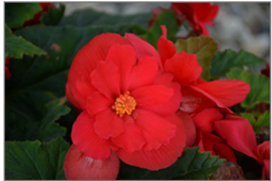
Nonstop Red Begonia flowers