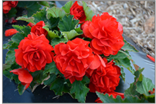
Nonstop Red Begonia in bloom

Nonstop Red Begonia is recommended for the following landscape applications;