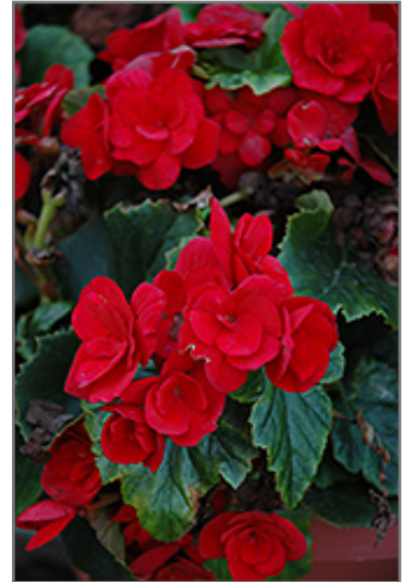
Baladin Begonia flowers

Large, elegant red double flowers stand out against dark green, heart shaped foliage; well branched with a mounded habit, ideal for patio containers, hanging baskets, beds and borders; deadhead to encourage blooms throughout the season