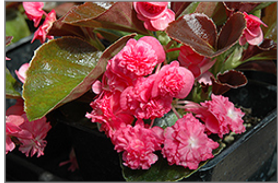
Doublet Rose Begonia flowers