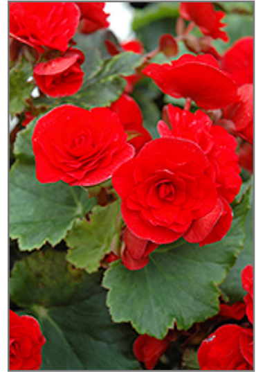
Red Baron Begonia flowers

Red Baron Begonia is recommended for the following landscape applications;