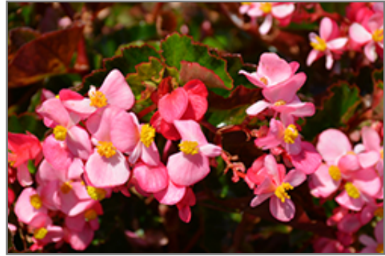
BabyWing Pink Begonia flowers