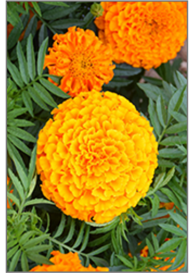
Taishan Orange Marigold flowers