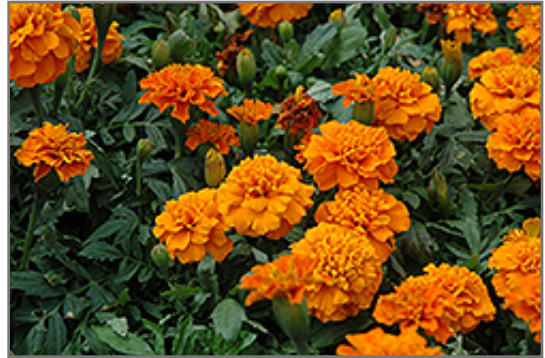
Janie Deep Orange Marigold flowers