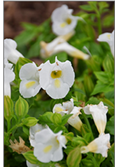
Catalina White Linen Torenia flowers