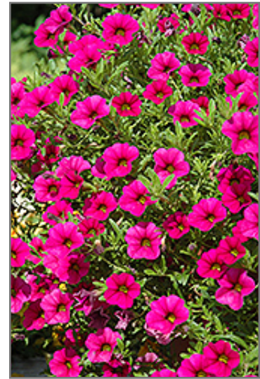
Cabaret Rose Calibrachoa flowers