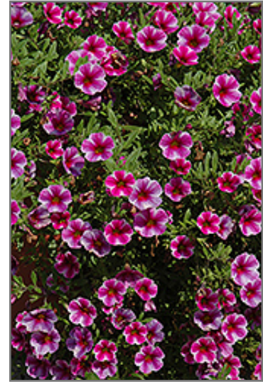
Can-Can Hot Pink Star Calibrachoa flowers

Can-Can Hot Pink Star Calibrachoa is recommended for the following landscape applications;