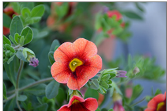
Celebration Mandarin Calibrachoa flowers