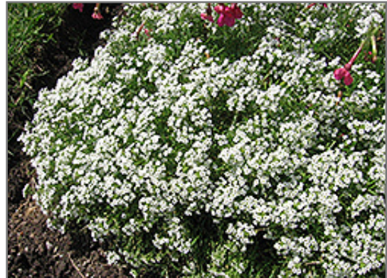
Wonderland White Alyssum in bloom