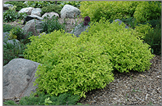
Goldmound Spirea