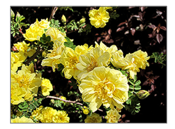
Flore Pleno Rose flowers

This is a high maintenance shrub that will require regular care and upkeep, and is best pruned in late winter once the threat of extreme cold has passed. It is a good choice for attracting bees to your yard. Gardeners should be aware of the following characteristic(s) that may warrant special consideration;