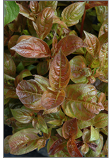
Wings Of Fire Weigela foliage

* This is a 'special order' plant - contact store for details