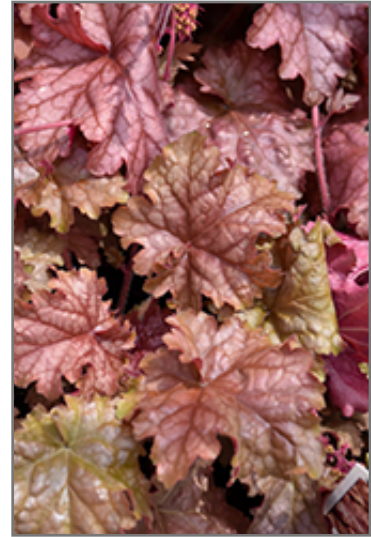
Carnival Peach Parfait Coral Bells foliage

Carnival Peach Parfait Coral Bells is recommended for the following landscape applications;