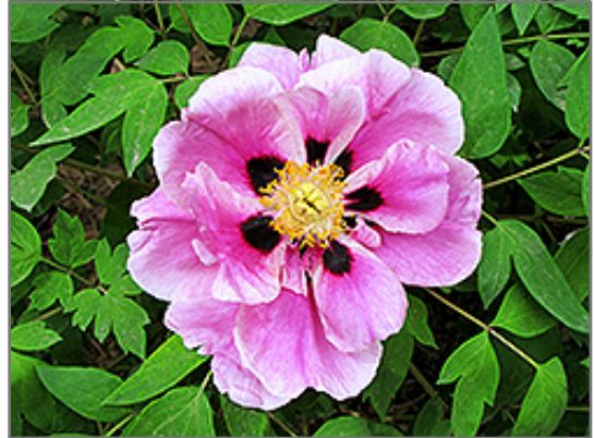
Shan Hai Guan Tree Peony flowers

Vibrant pink-violet petals with white edges and contrasting black flares, surrounding a cluster of golden stamens; great as an accent in the garden or massed in borders; unlike perennial peonies, remember not to prune this variety