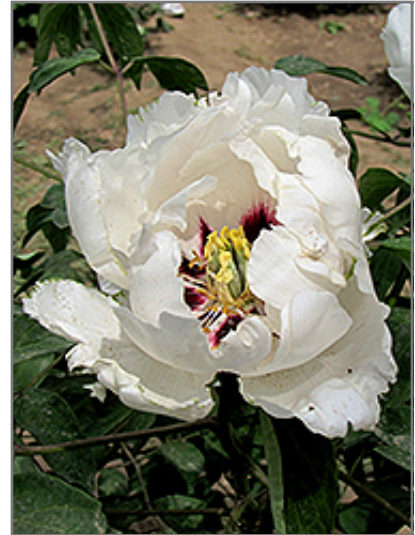
Xue Shan Xian Zi Tree Peony flowers

Xue Shan Xian Zi Tree Peony will grow to be about 6 feet tall at maturity, with a spread of 5 feet. It has a low canopy, and is suitable for planting under power lines. It grows at a slow rate, and under ideal conditions can be expected to live for 50 years or more.