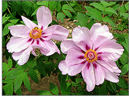
Lan Bao Shi Tree Peony flowers