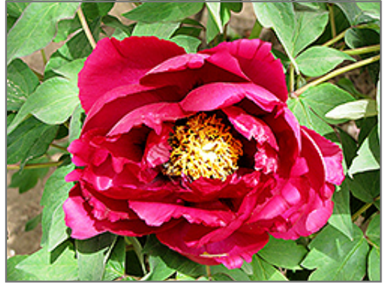
Rimpoh Tree Peony flowers

A beautiful woody peony for the garden, presenting crimson-violet double blooms with yellow stamens; great as an accent in the garden or massed in borders; unlike perennial peonies, remember not to prune this variety