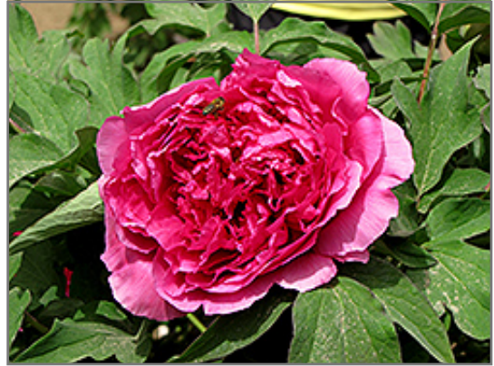
Wu Long Peng Sheng Tree Peony flowers