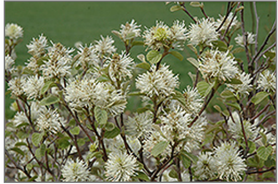
Dwarf Fothergilla flowers

This shrub does best in full sun to partial shade. It requires an evenly moist well-drained soil for optimal growth, but will die in standing water. It is not particular as to soil type, but has a definite preference for acidic soils, and is subject to chlorosis (yellowing) of the foliage in alkaline soils. It is somewhat tolerant of urban pollution. This species is native to parts of North America.