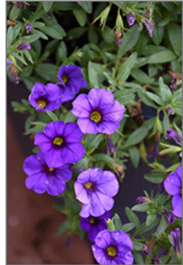
Aloha Kona Midnight Blue Calibrachoa flowers

Aloha Kona Midnight Blue Calibrachoa is recommended for the following landscape applications;