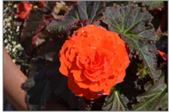
Nonstop Mocca Deep Orange Begonia flowers

Nonstop Mocca Deep Orange Begonia is recommended for the following landscape applications;