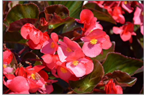
Whopper Rose Bronze Leaf Begonia flowers