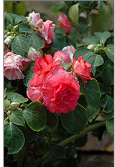
Fiesta Salmon Double Impatiens flowers

Shade tolerant with excellent branching and uniformity, this series presents large, brightly colored, double blooms resembling roses; self-cleaning, no deadheading needed; an outstanding choice for garden landscapes and containers