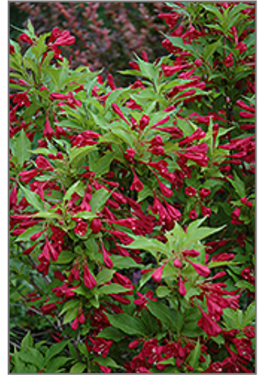
Red Prince Weigela flowers

* This is a 'special order' plant - contact store for details