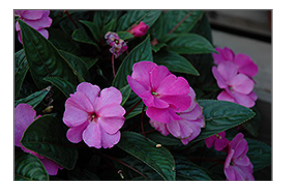
ColorPower Dark Pink New Guinea Impatiens flowers