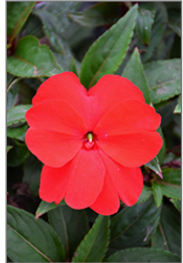
Florific Red New Guinea Impatiens flowers

Florific Red New Guinea Impatiens is recommended for the following landscape applications;