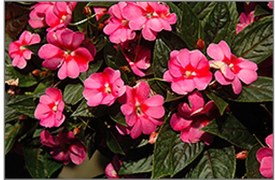
Harmony Marshmallow Cream New Guinea Impatiens flowers

Harmony Marshmallow Cream New Guinea Impatiens is recommended for the following landscape applications;