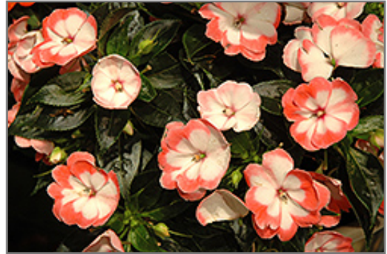
Harmony Radiance Coral New Guinea Impatiens flowers

Harmony Radiance Coral New Guinea Impatiens is recommended for the following landscape applications;